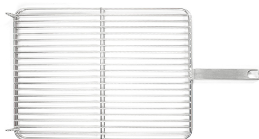
DOUBLE SQUARE GRILL GRATE