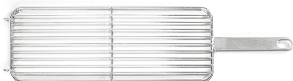
DOUBLE RECTANGULAR GRILL GRATE