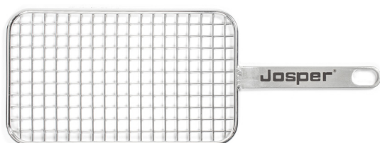
SIMPLE MINI GRILL GRATE