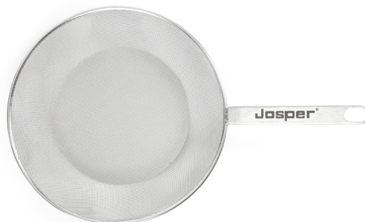
METAL MESH PAN