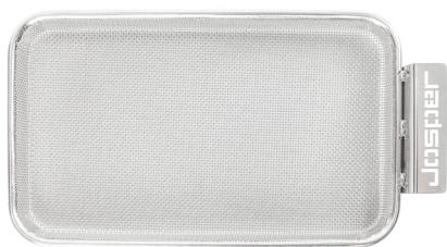
MINI MICROPERFORATED METAL GRILL GRATE WITH GRIP